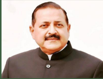
Dr. Jitendra Singh Hon'ble Minister (S&T) Vice President, CSIR

"The campaign to showcase the legacy, exclusive innovations and technological breakthroughs of each lab every successive week"