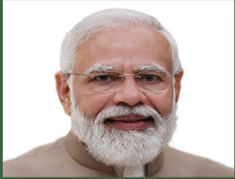
Shri Narendra Modi Hon'ble PM of India President, CSIR