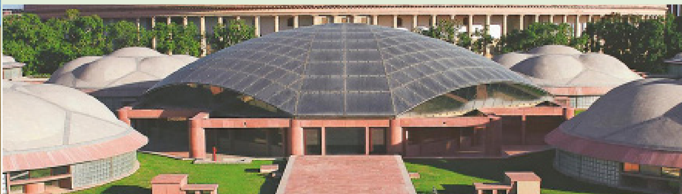
Prototype of Parliament House Library roof dome tested at CSIR-SERC