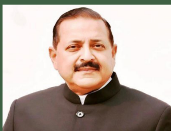
Dr. Jitendra Singh Hon'ble Minister (S&T) Vice President, CSIR

"The campaign to showcase the legacy, exclusive innovations and technological breakthroughs of each lab every successive week"