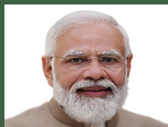
Shri Narendra Modi Hon'ble PM of India President, CSIR